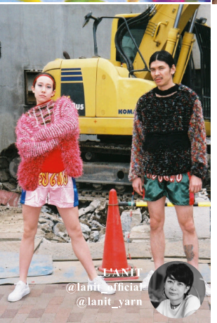
L'ANIT @lanit_official @lanit_yarn