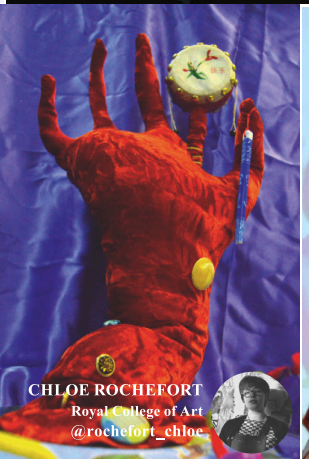
CHLOE ROCHEFORT Royal College of Art @rochefort_chloe