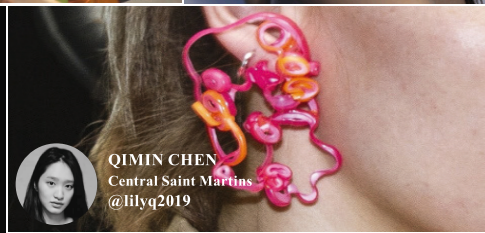
QIMIN CHEN Central Saint Martins @lilyq2019