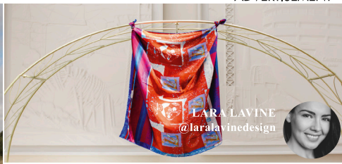
LARA LAVINE @laralavinedesign